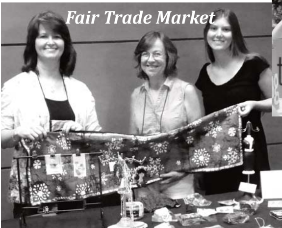
Fair Trade Market