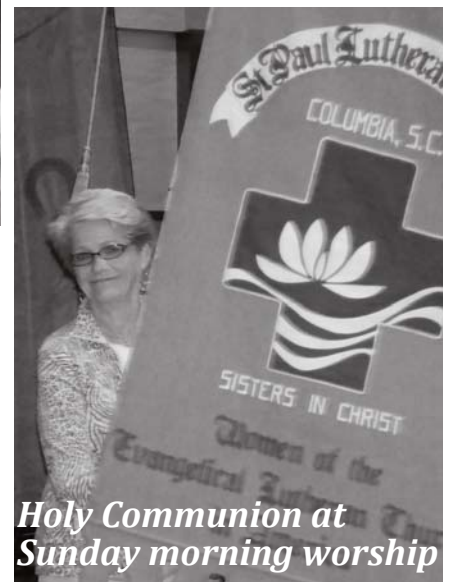
Holy Communion at Sunday morning worship