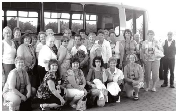
Those who spent the workshop time on a bus tour of Charleston had a wonderful time.