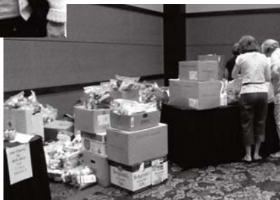
Right: Almost 1900 comfort kits and hundreds of extra items were piled into the Convention Hall until pick-up on Sunday

Checks from Convention offerings and donations totaling almost $2,300 were sent to the American Red Cross Low Country Region