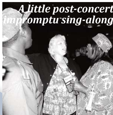
A little post-concert impromptu sing-along