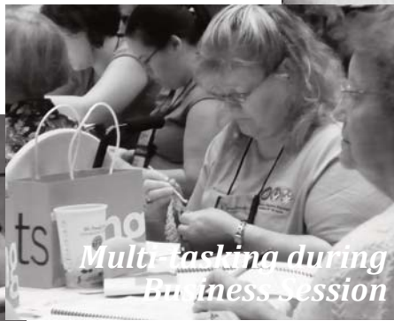
Multi-tasking during Business Session