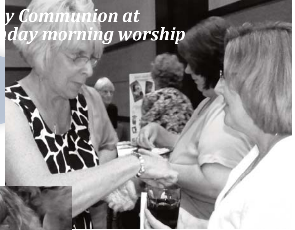
Holy Communion at Sunday morning worship